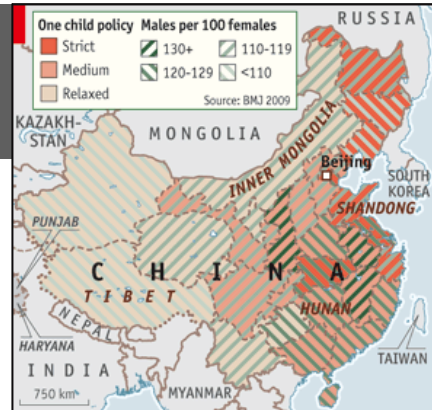
Right: Map of gender ratios and One-Child Policy enforcement in China by province.

Use these maps to pray for the families in every Chinese province and city. Note that the central and southeastern provinces have some of the highest rates of gendercide. Pray especially over the central leadership in Beijing, over provinces with recent known cases of forced abortion (Anhui, Shaanxi, Shandong), over areas where child bride trafficking is common (Fujian), and over our brothers and sisters in Jesus throughout China.